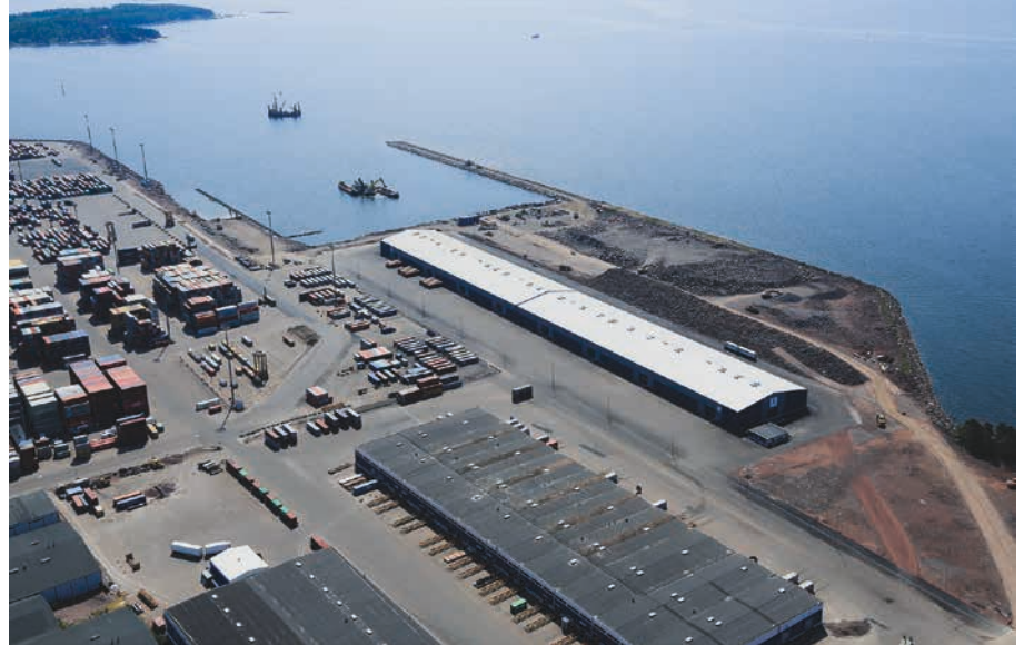
Dredged earth material and clean concrete and brick waste, among other things, have been utilised in the construction of the D-area at Mussalo.

Port of HaminaKotka Ltd applies the principles of sustainable development and circular economy to the construction work. As an example, in 2012 to 2017 more than 150,000 cubic metres