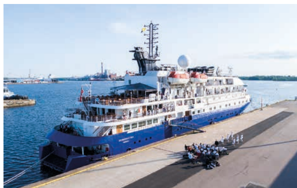
The M/S Hebridean Sky visited Kantasatama Harbour in Kotka in July 2019.