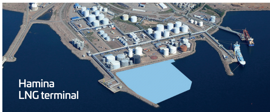
The construction of the LNG terminal in Hamina will take three years. The total value of the investment is about 95 million euros.