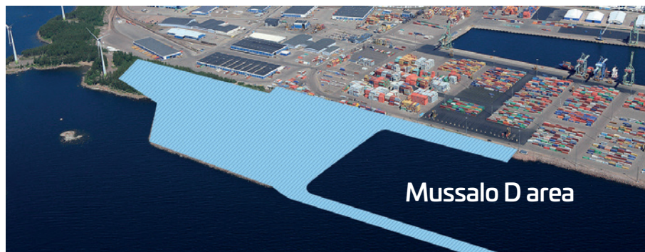
The new port centre to be built at Mussalo will serve the transport of the Finnish wood-processing industry in particular.